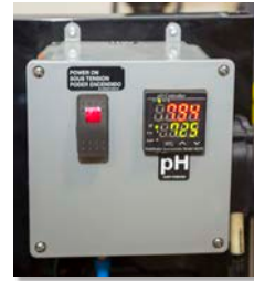
Optional pH controller, WX-0130