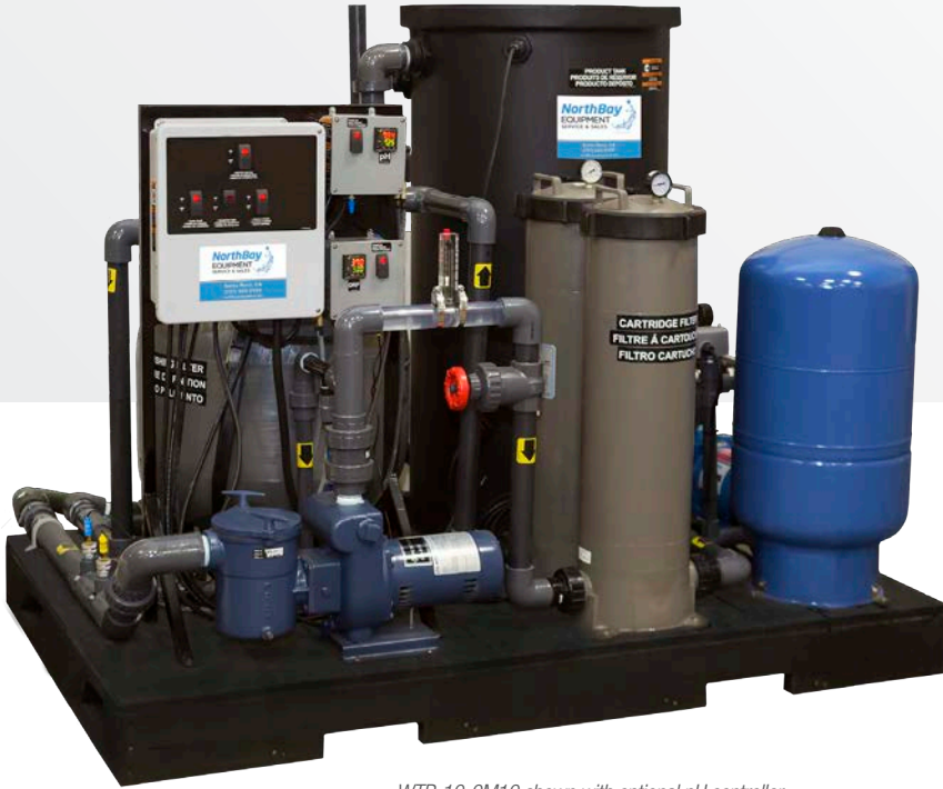
WTR-10-0M10 shown with optional pH controller, WX-0130 and ORP controller, WX-0131

THE COMPACT WTR SERIES SYSTEMS ARE GREAT FOR SMALL WASH BAY SET-UPS. THEY ARE A COST-EFFECTIVE SOLUTION TO FILTER WASH WATER FOR REUSE THROUGH A PRESSURE WASHER OR FOR PROPER DISPOSAL.